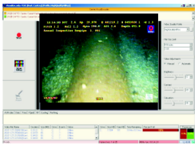
Real-time Display of Visual Encoder Video Data Capture Module

VisualEncoder provides a continuous real-time display of the video images and on-line survey navigation data as well as providing comprehensive system status information. All video data can be streamed live to other PC's on the survey vessel via the LAN. All data inputs are time synchronised enabling simultaneous playback of all events on all/any cameras using the VisualEdit video review module.